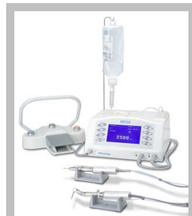
Dental instruments require biocompatible components.

Medical technology has to comply with numerous specifications especially regarding biocompatibility what represents an outstanding and normally insuperable challenge to traditional lubricants. In summer of 2006, the description of Dicronite's friction reducing technology drew the