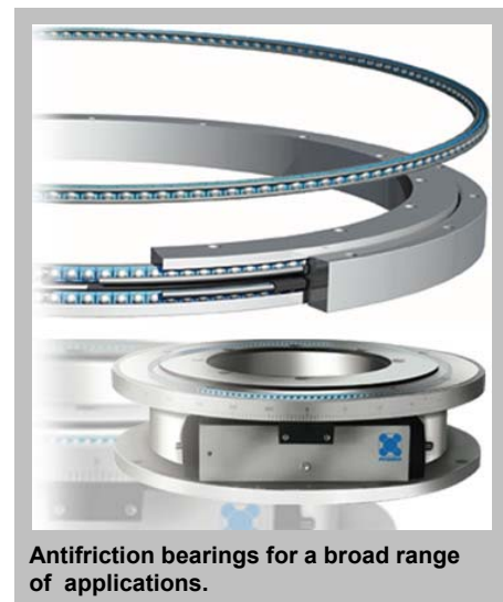
Antifriction bearings for a broad range of applications.

Looking for a possibility to increase the lifetime of a bearing within a gearbox and hence to comply with the required specifications Franke asked ESA's prime contractor for the Technology Transfer Programme (TTP), MST Aerospace for an intermediation regarding the Dicronite technology so that the contact between Franke and Dicronite was established in spring of 2005 followed by regular placed coating orders up to our days.