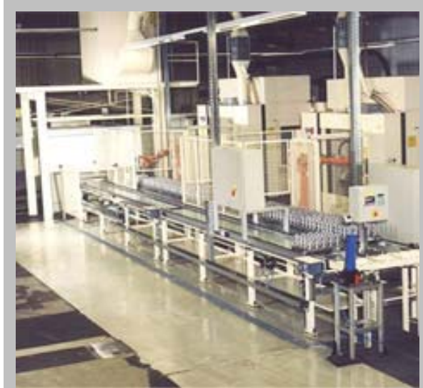
Automation facility with gear rods and pinion gears.

Successful tests conducted in the following two months resulted in a first purchase order in March of the same year. Since this first order, the application of the central lubrication isn't necessary any more because the coated rods and pinions operate without any remarkable maintenance and made AuE a regular customer of Dicronite U.T.E. Pohl.